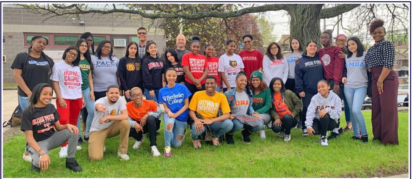
Seniors at Rosa L. Parks School of the Fine and Performing Arts celebrate National College Decision Day.