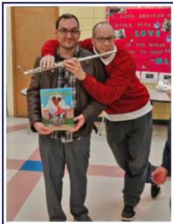
MLK Rutland Center